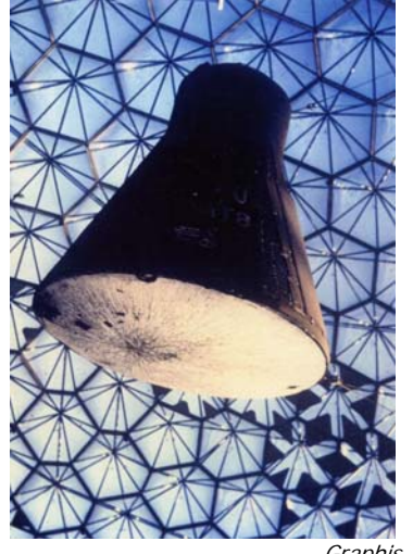
Another view inside the the Montreal Dome showing the first US re-entry space capsu