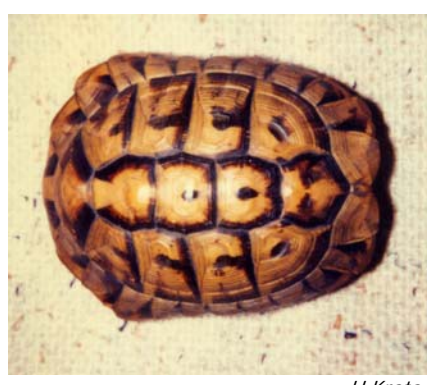
H Kroto A tortoise shell