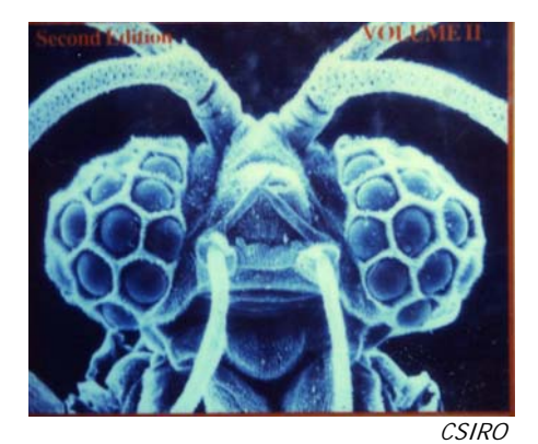
An Australian fly's eye

When you find the pentagons in these pictures, draw round them. It is best with a coloured pen or pencil